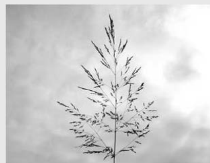
Open-branched, reddish panicle