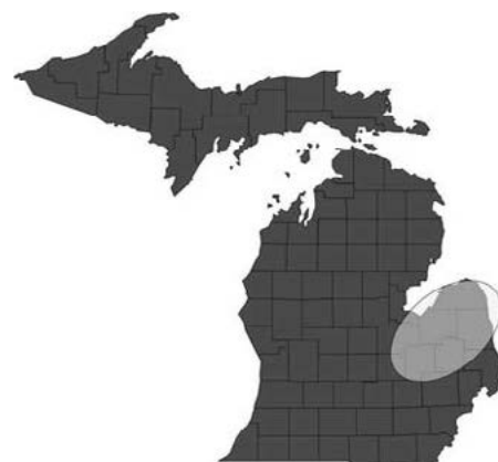
Common distribution of windgrass in Michigan