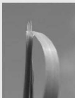
Jagged membranous ligule