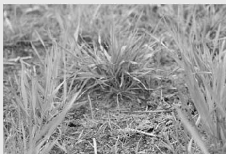
Tillering of windgrass in wheat