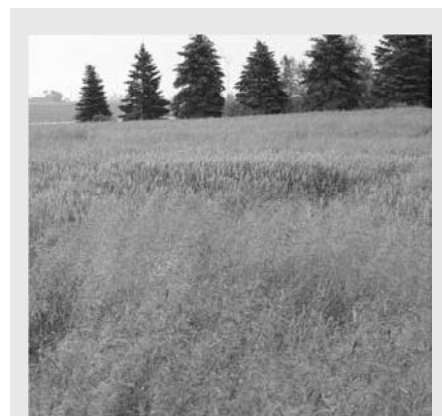
Windgrass in a Michigan wheat field